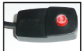
Rebellion Mode (+75%)